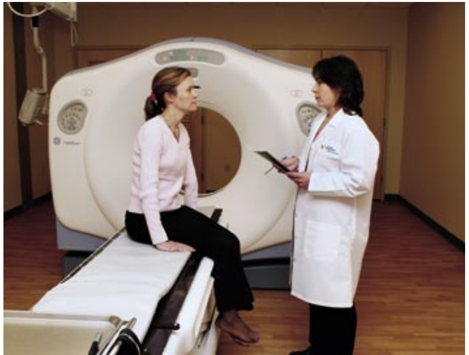
Patients have easy access to integrated imaging services.